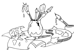
Sketch by Becky Driscoll

Hyperion Books, ISBN-10:1423139933 ISBN-13: 978-1423139935